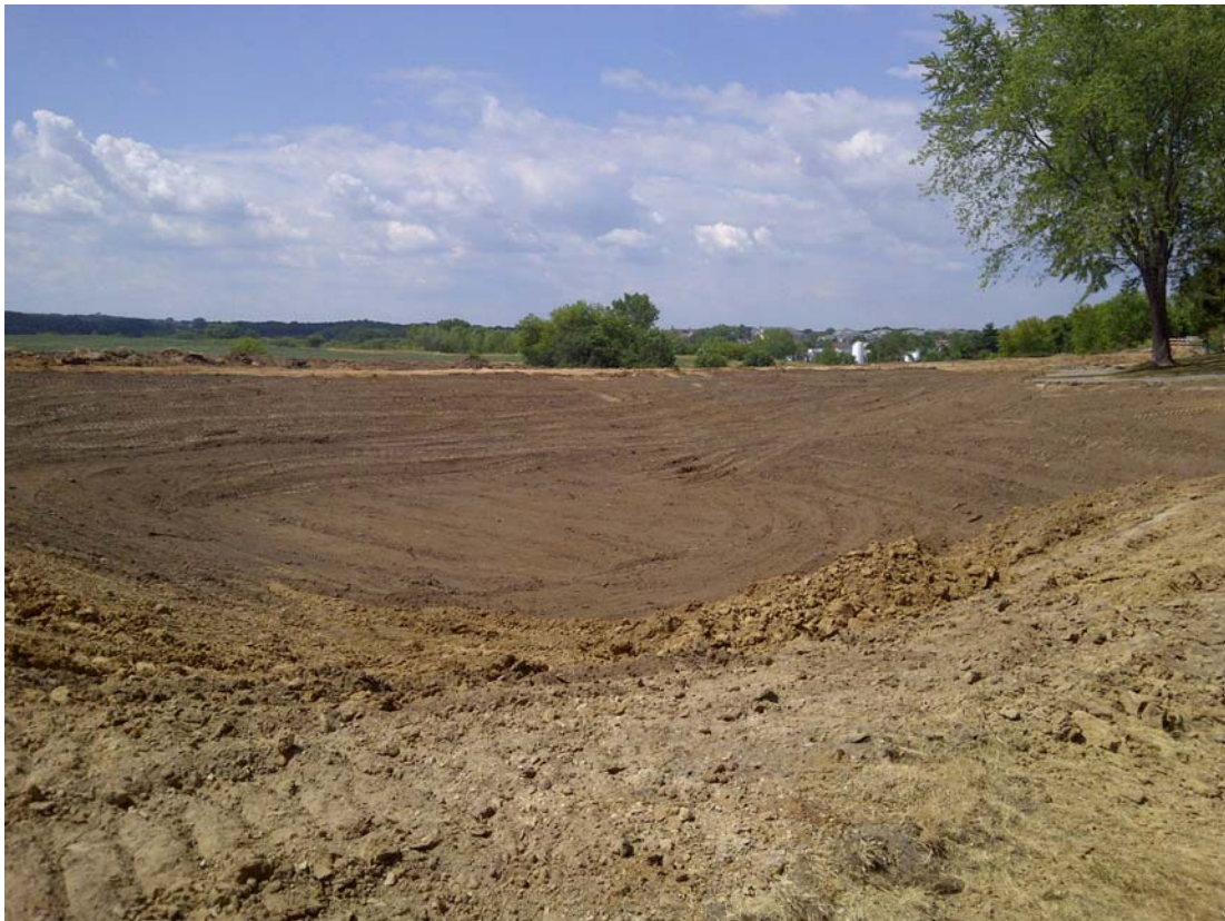
Status of Valley View Retention Pond, July 9, 2012

July 9 th , 2012 – The adjusted contours of the pond were corrected and completed as shown below. Next, the storm sewer will be installed including the outfalls for the pond and release structure in the southeast corner.