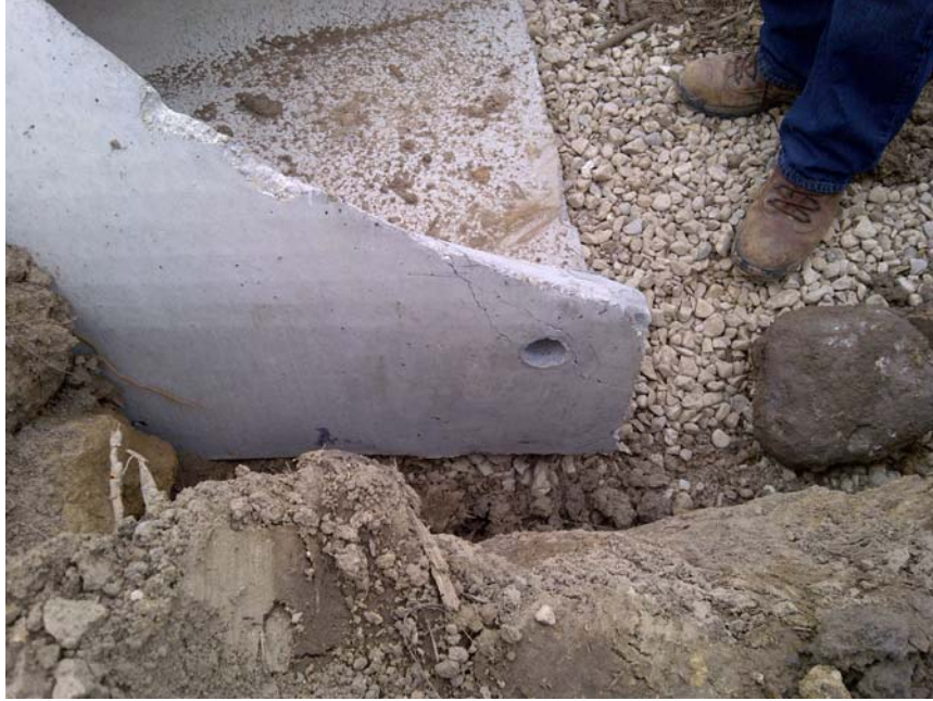
Storm sewer outfall located on the east side of the pond along Index Rd