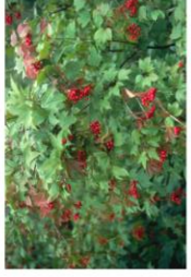
Highbush cranberry Viburnum trilobum