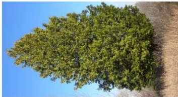
Northern white cedar Thuja occidentalis