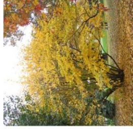
Common witchhazel Hamamelis virginiana