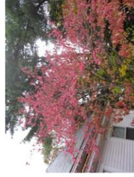
Eastern wahoo Euonymus atropurpurea