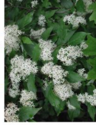
Gray dogwood Cornus racemosa