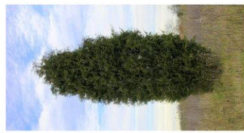
Eastern red cedar Juniperus virginiana