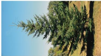
White spruce Picea glauca