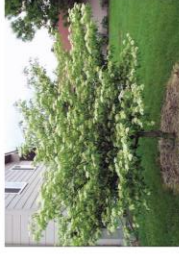
Pagoda dogwood Cornus alternifolia