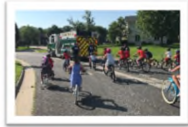
Lacy Heights Bike Parade