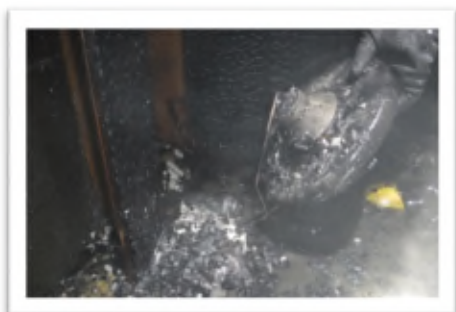
Aztec Trail Structure Fire