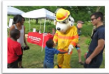
Leopold Community Night

The City of Fitchburg Fire Department promotes fire and life safety education for Fitchburg residents and its visitors through fire education programs and events throughout the year.