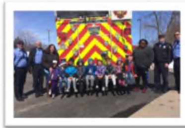
Woods Hollow Daycare