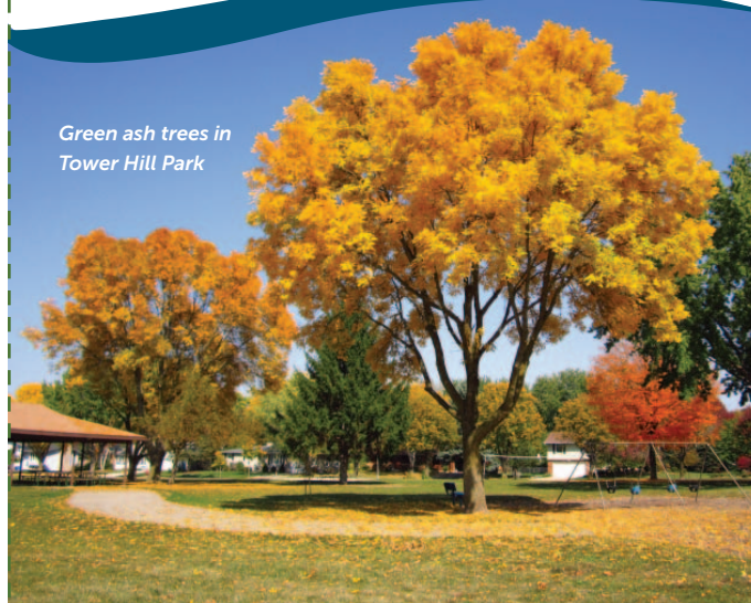
Green ash trees in Tower Hill Park