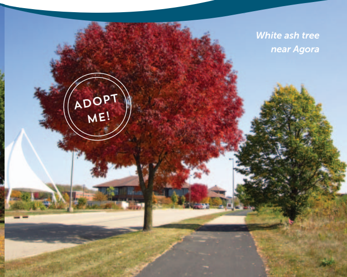
White ash tree near Agora