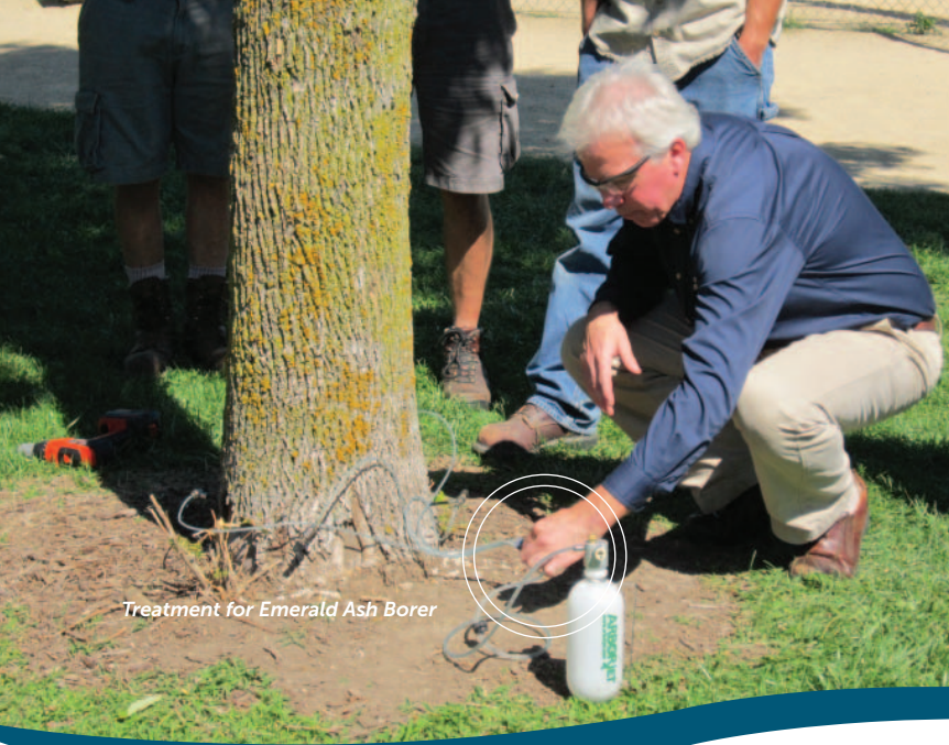
Treatment for Emerald Ash Borer