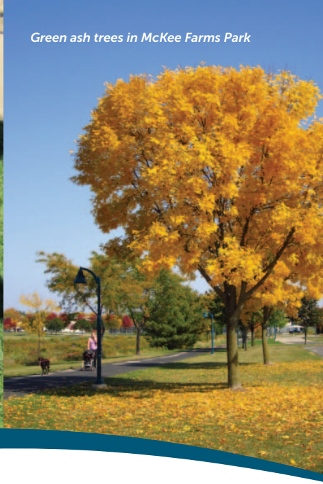
Green ash trees in McKee Farms Park